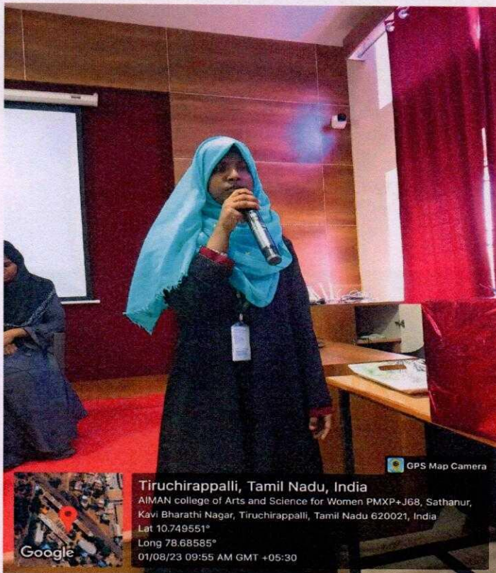
RECITATION OF QIRATH